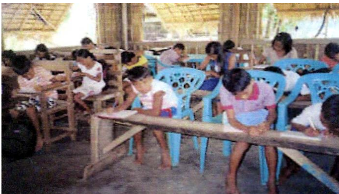
Children in a leaking and crowded classroom. No desk to sit or to write

“ TOFA Awardees can make a big difference and will accomplish something tangible with a focused and single project at a time, rather than spreading energy and resources thinly. I urge all TOFA Past Awardees to bond together to assist in the Classroom Project and other projects for the Philippines. Let’s support the Feed the Hungry, Inc. And .... let there be peace on earth; let it begin with me, ” added Nonoy Mendoza.