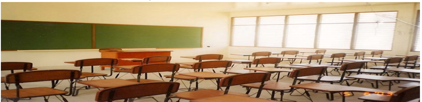
The project of Feed the Hungry, Inc. and the RAM Memorial Foundation