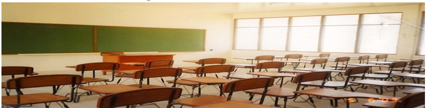
A completed and finished project of Feed the Hungry, Inc. and the RAM Memorial Foundation