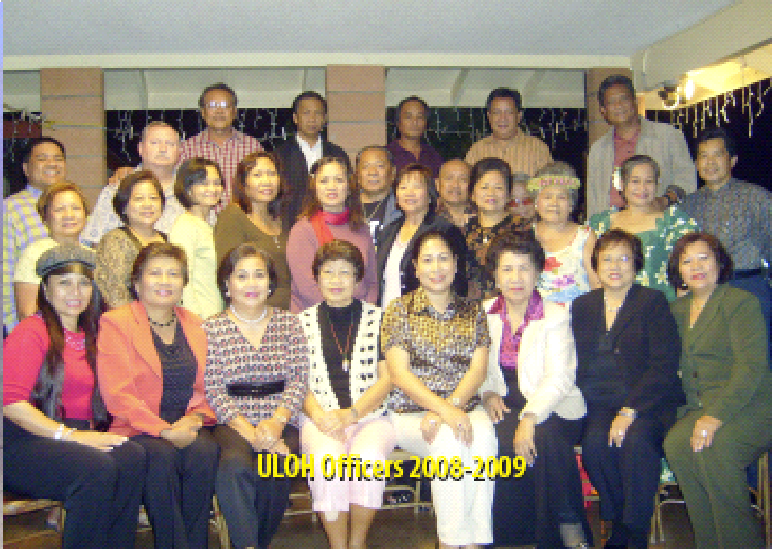
ULOH Officers 2008-2009